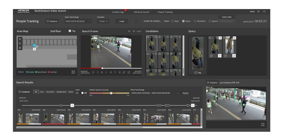
Figure 2. Tracking and Incident Management Features

Multifeature Video Search is part of an end-to-end portfolio of video intelligence and IoT solutions offered by Hitachi Vantara, such as Lumada Video Insights, to enable safer, smart spaces.