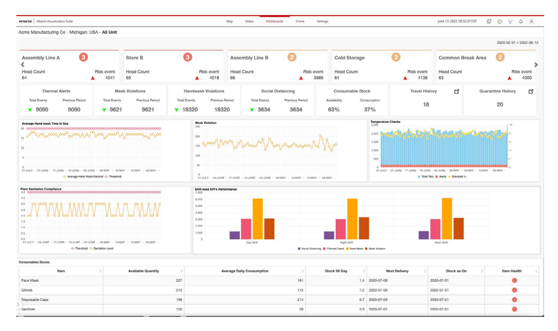
Fig. 2 Custom Dashboards