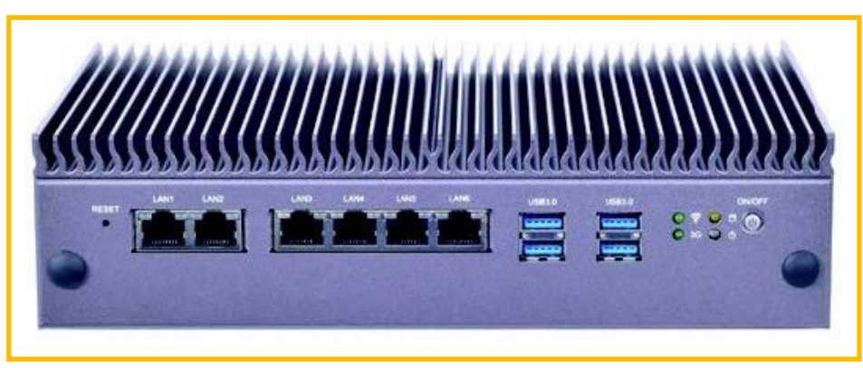
Figure 3. Hitachi Edge Gateway for Video