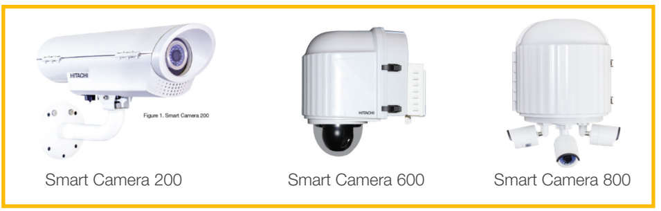
Figure 1. Hitachi Smart Cameras

Intelligence is an end-to-end, intelligent and adaptable solution for cities, airports, retail, transportation, campuses and more. By providing intelligence for urban, commercial and industrial areas, Smart Spaces and Video Intelligence helps organizations become more effective, efficient and safer.